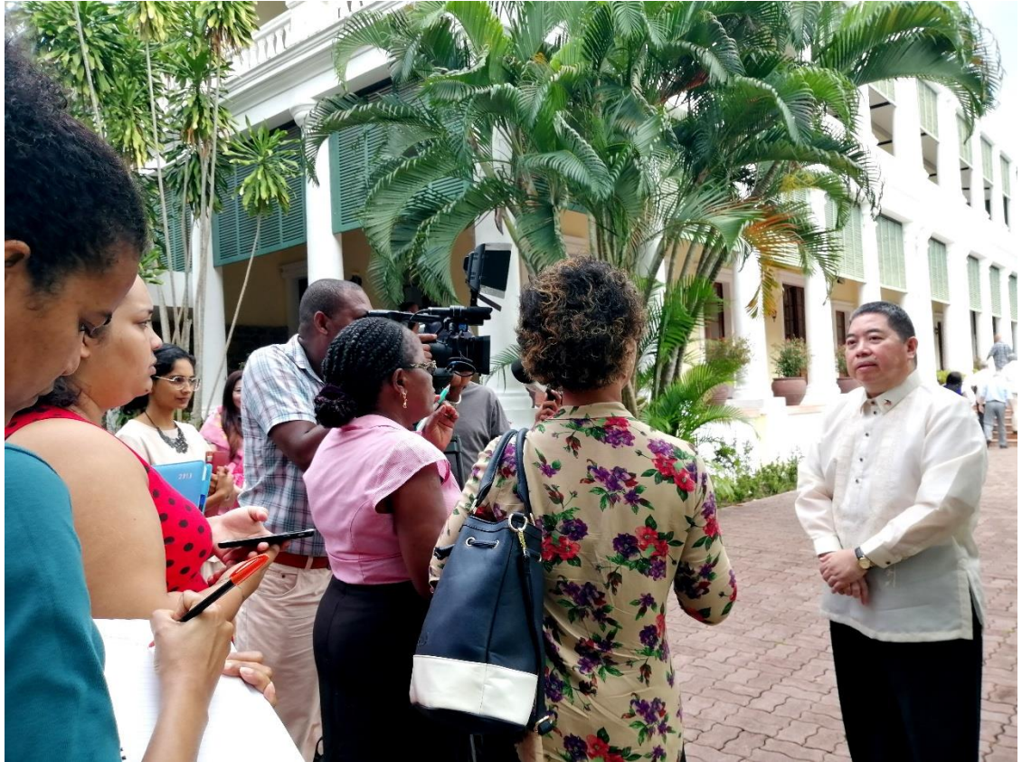
Ambassador Chua being interviewed by the State House Press Corps after his Presentation of Credentials